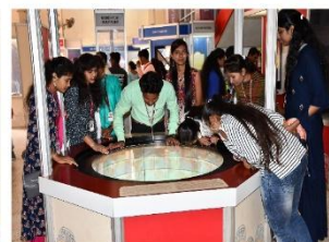
SCIENCE CITY AND PLANETRIUM